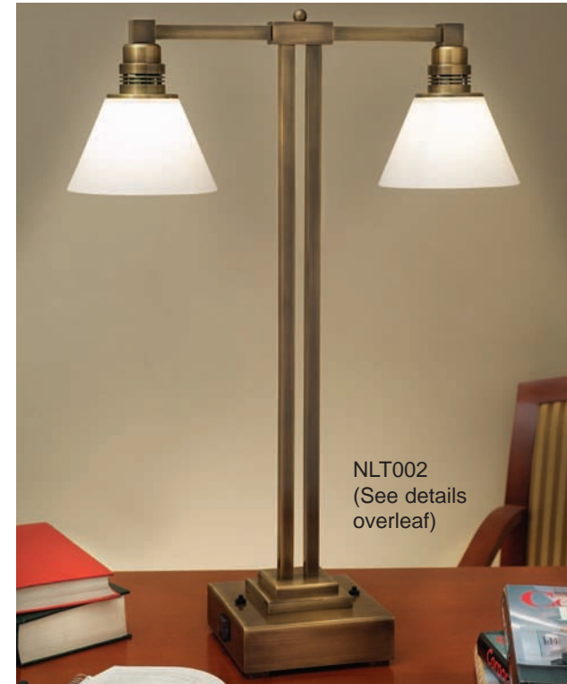
NLT002 (See details overleaf)

Nessen Lighting 20 Pocono Road P.O. Box 165 Brookfield CT 06804 Tel 203 775-1805 • Fax 203 775-0797 nessenlighting.com