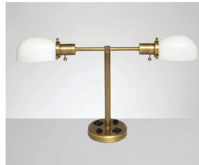
NLT004 Solid brass, 15 1/2" "Emmitsburg" library table lamp (adapted for Mount St. Mary's University, Maryland, from Nessen catalog item NT988) H15 1/2", W26" Base: 6" diam. Two outlets and two computer ports added. Two sockets controlled by on/off switches on socket cups. 75W max. each. Shades: Imported white opal glass Metal Finish: Antique brass #3

Read back cover for options in materials, finishes, shades, lamping, etc.