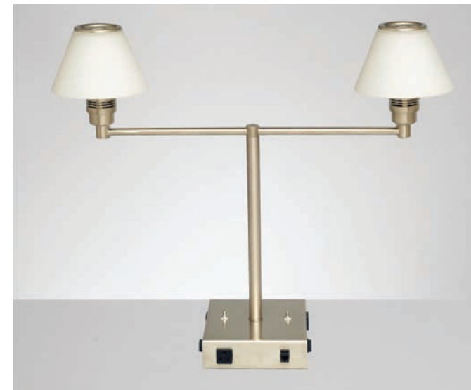
NLT005 Solid brass, 19" "Colorado" library table lamp Adapted from Nessen catalog item NT957 for University of Denver's College of Law H19", W26" Base: 7" square Outlet and computer port on four sides of base. Two sockets controlled by on/off switches on base. 50W max. halogen lamps Shades: White frosted glass, metal top edges Metal finish: Satin nickel