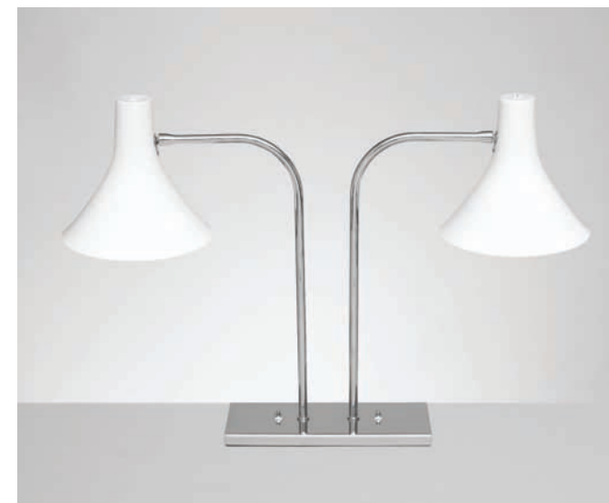
NLT006 Solid brass, 20 1/2" "Flare" library table lamp Nessen Studio design H20 1/2", W29 1/2", Base: 4 1/2" x 12 1/2" Base can accept outlets and ports, design allows for free-standing or surface-through applications. Two sockets controlled by on/off switches on base. 75W max. each. Shades: Spun aluminum, baked white enamel finish Metal finish: Polished chrome